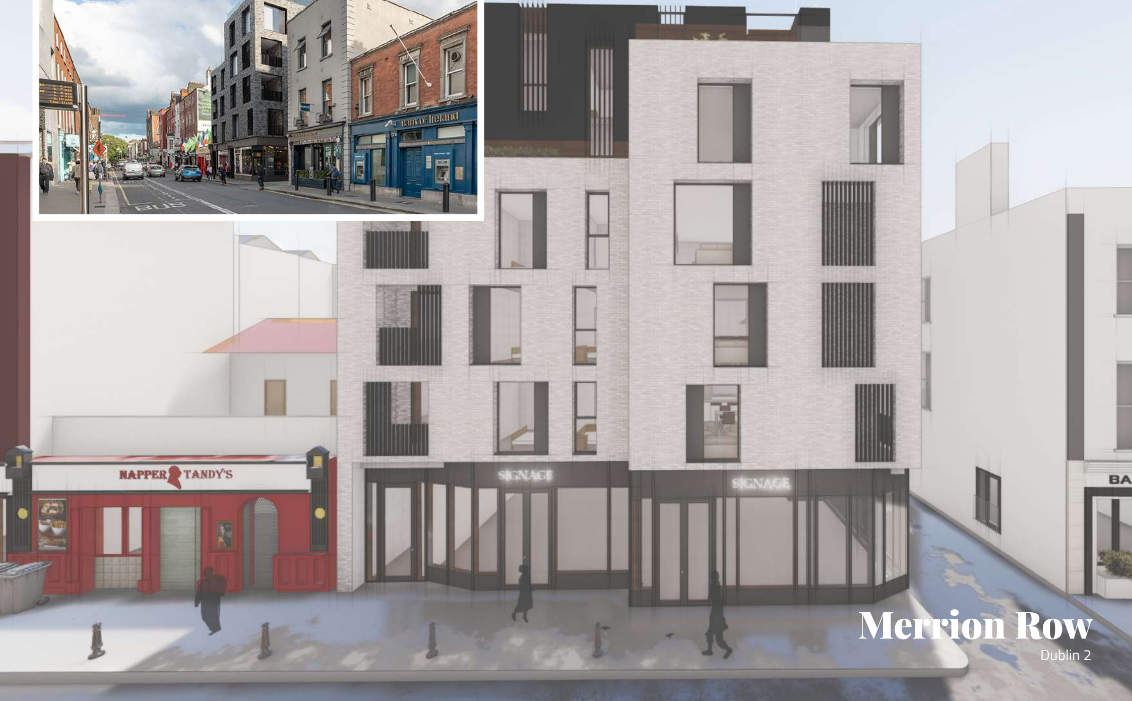
Merrion Row Dublin 2